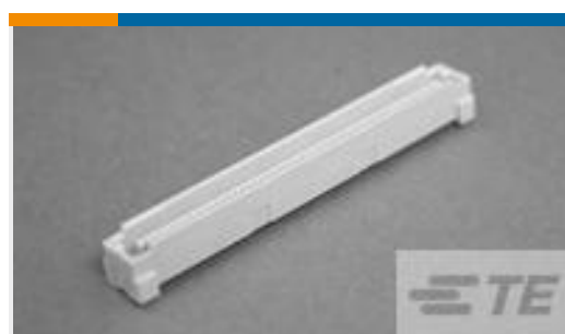
TE Part # 5179029-1 0.8FH,P06H.5,040,08/Sn,TU