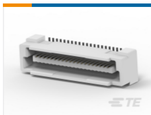
TE Part # CAT-313-PCB40 Free Height Plug Connector: Board-to-Board, Vertical, 40, 0.8mm