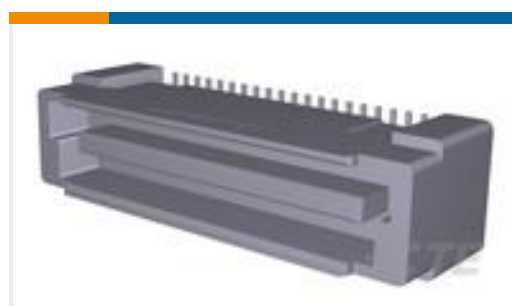
TE Part # 1735434-1 0.8FH,P08H.5,040,08/Sn,TR,KT